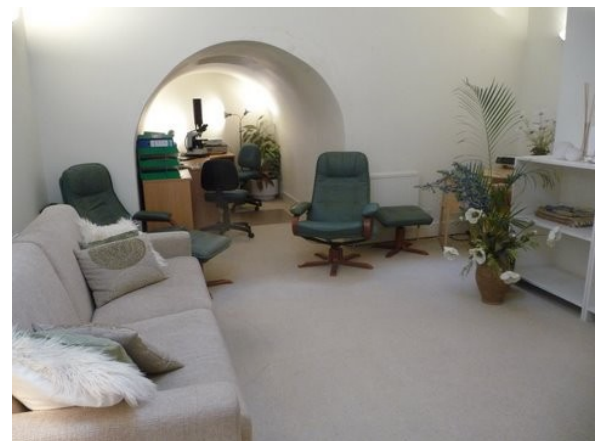
Tanya's Live Blood Analysis Area